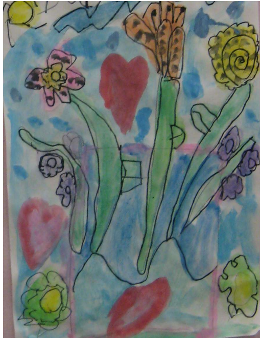
Student Work. (2012). Flower Bouquet [Painting]. Used with Permission.

According to Pelo (2007), "when children draw, they create representations of their experiences, observations, theories, and emotions" (p. 85). In kindergarten, there are many opportunities to find student understanding through the arts many children at that age are not capable of writing yet. Works of art "tell stories and communicate particular perspectives" (p. 85) as noted in the sample of student work.